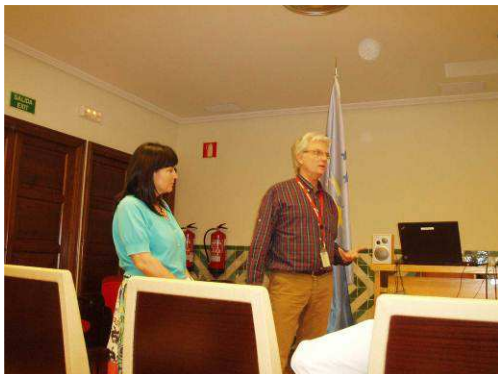
Presentation of Open School's results

10.15 h Student Meeting (LU): conclusions. By Nicolas Negretti