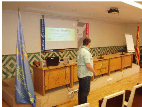
Presentation of Student Meeting's results