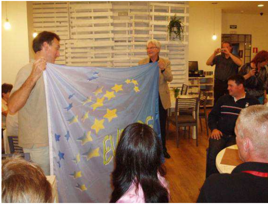
M. Lavilla / M. Stok

21.00 h Dinner at hotel / transfer of the presidency of EUROPEA to The Netherlands