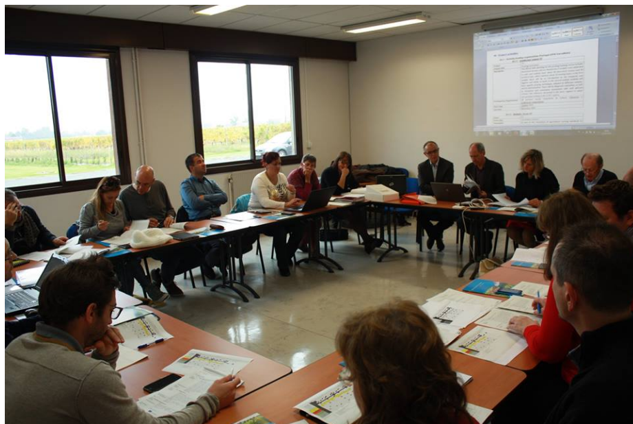
WORKING ON VITEA PROJECT MANAGEMENT