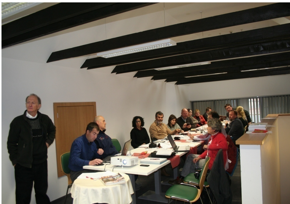
WORKING ON ECVET