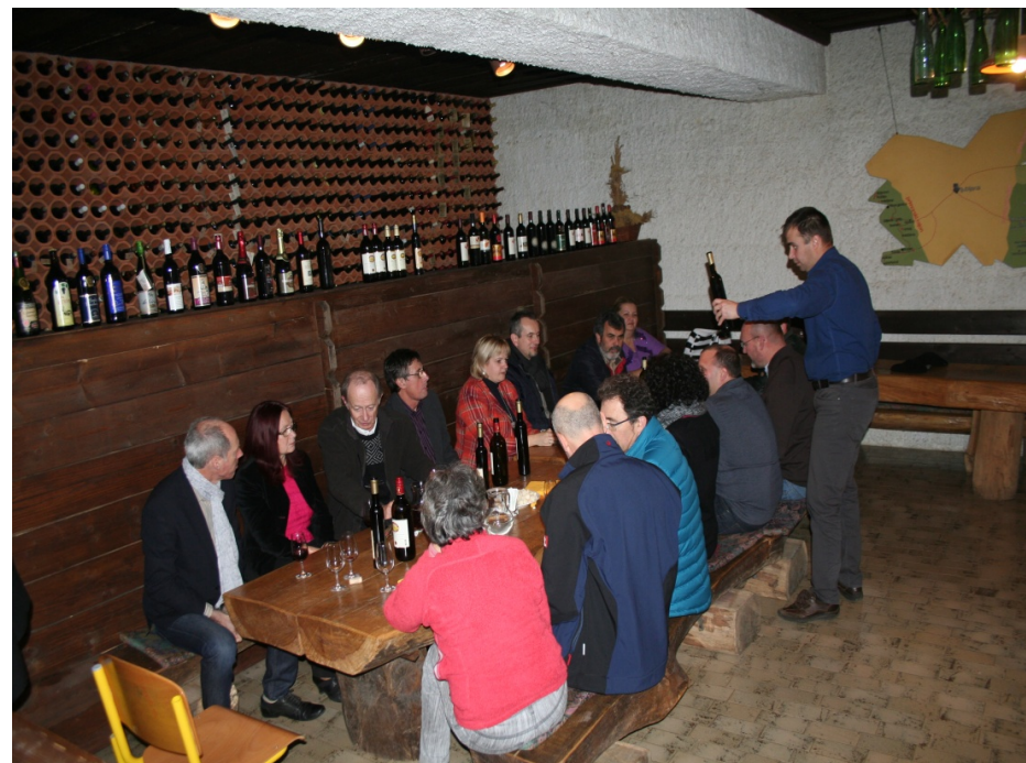
TASTING WINES IN HISTORIC WINE SCHOOL CELLAR