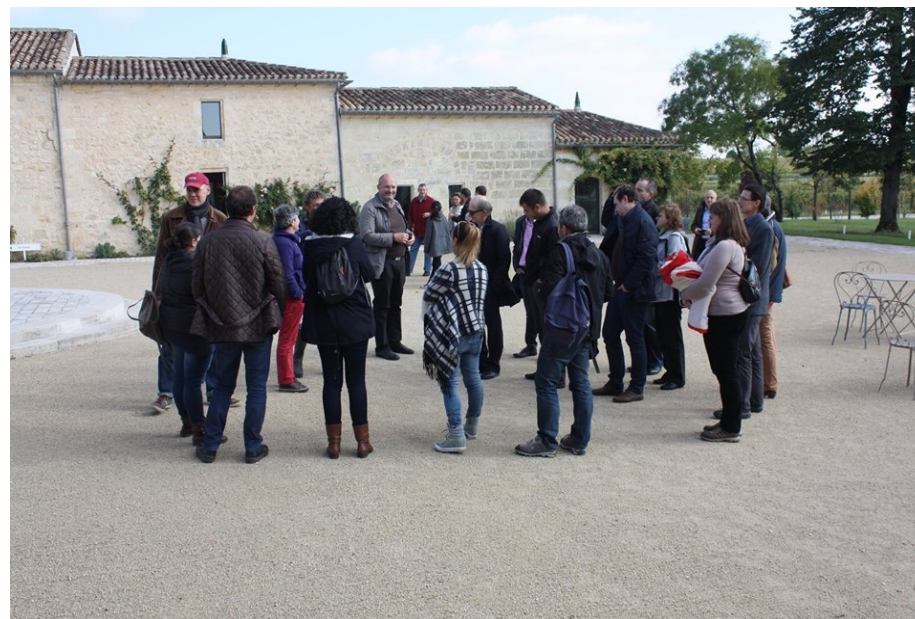
VISIT OF CHATEAU SOUTARD IN SAINT EMILION