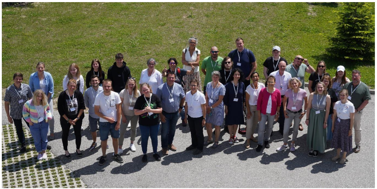
Digitalis partners at the Krems wine school from Austria, Germany, Estonia, Luxembourg, England, Poland, Spain and Ukraine.