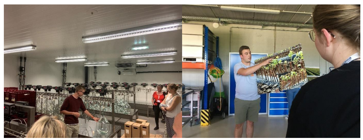
Students of the wine management course guided the guests through the wine school.